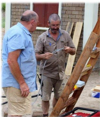
Working on the solar pump