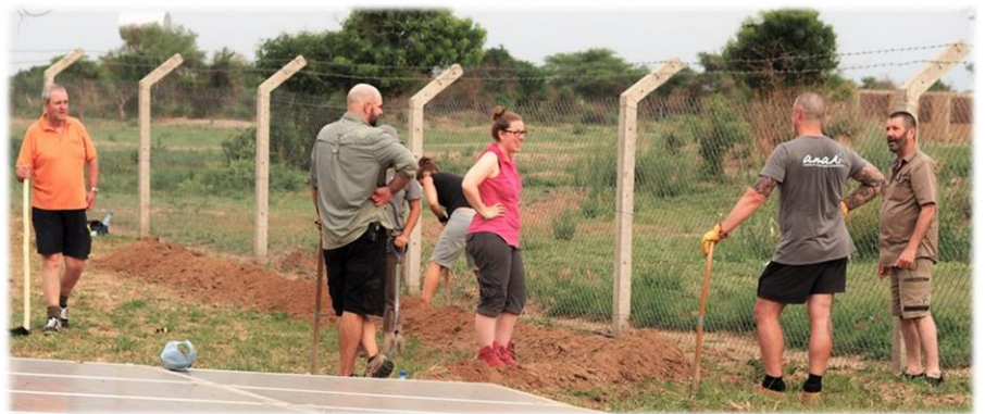
Working out where the trench was to be built to connect electrical cables from the solar farm to the house