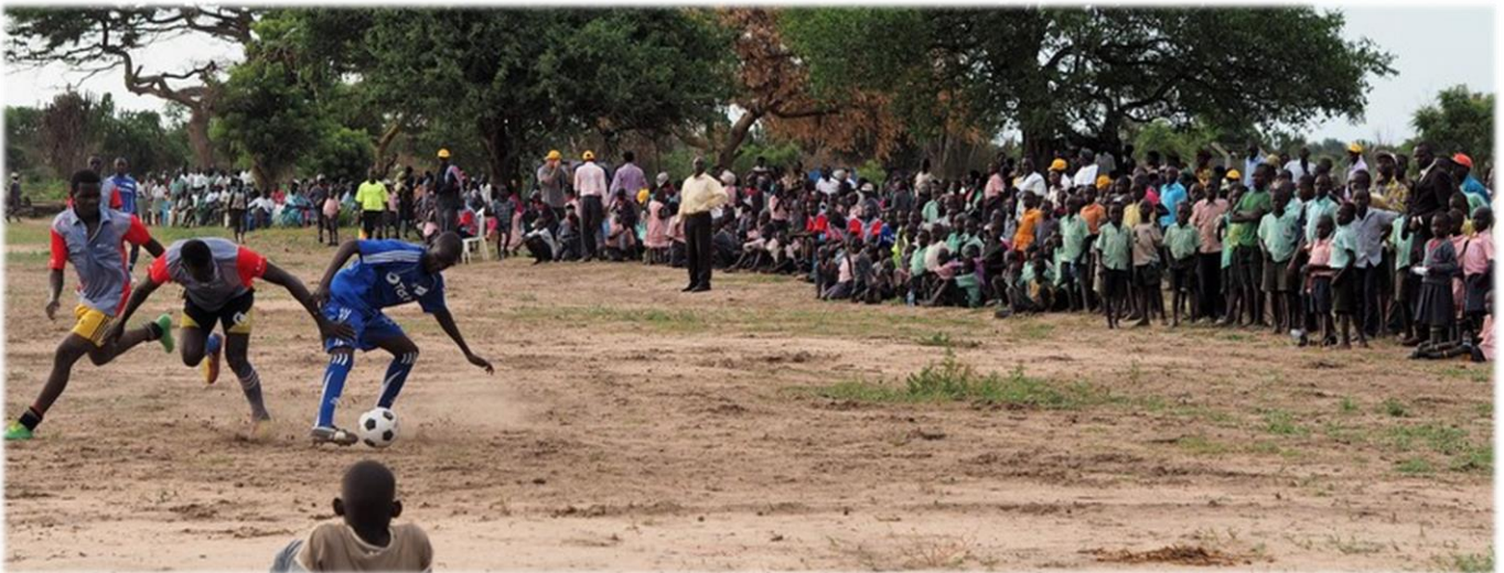
After our school opening, Amari staff played soccer against a team of Buliisa District civil servants. Invited guests and other community members stayed to watch.

After 18 months of no mains solar, and 6 months of limited onsite water supply, we are enjoying , thanks to our team and their technical expertise.